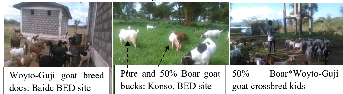
Figure 1. Woyto-Guji Does, Boar bucks, and crossbred kids in the study area

The birth weight, weaning weight, six month weight and yearling weight for single born crossbred kids were 2.96±0.40, 12.79±2.06, 17.79±3.58 and 30.50±4.46 kg, respectively. The corresponding values for twin born were 2.44±0.45, 8.51±1.59, 12.71±3.24 and 25.67±3.54 kg. The difference in body weights for different type of births at all age groups may be due to that litter mates had to share the prenatal maternal nourishment in contrast to the single born kids (Zahraddeen et al. , 2008). Local, exotic and crossbred goats were presented in Figure 1.