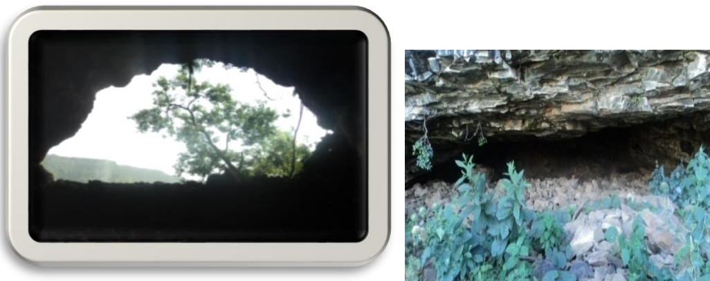
Fig. 6. Caves in Quara served Kasa as shelters during his Shifta life

As a shifta in Quara, Kasa achieved successive victories over his enemies. His early victories over his enemies not only persuaded his enemies to tame him but also foreshadowed more decisive victories of the 1850s when he cleared the way to the throne.