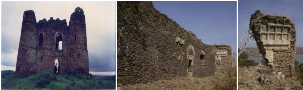
Fig.1. Ruins of Sarsa Dengel's palace at Guzara, and Ginb Mariam Church at Gorgora.

Since the transfer of the political power from the Zagwe Dynasty to the " Solomonic " (1270) and prior to the foundation of Gondar as a fixed capital, the Medieval Ethiopian state was known for its moving capitals. The shift of the political center of the state from Shewa to the Lake Tana area in the second half of the sixteenth century set up a fertile ground for the cultural developments in the area as many localities were frequented as temporal capitals or camps by the monarchy. With the shift of the political center, several sites along the northern shores of Lake Tana became temporary camps or capitals by the predecessors of Emperor Fasiladas. Thus, Gubae and Guzara to the northeast of Lake Tana, Gorgora, at the northern end of the Lake and Azezo and Denqaz, to the south and south east of Gondar were used as capitals, the first two by Emperor Sarsa Dengel(1563 - 1597) and the last three by Emperor Suseneyos(1607 – 1632) (Pankhurst 1967: 149).