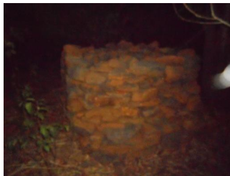
Fig.5. The site supposed to be the birth place of Emperor Tewodros II at Chergie Mariam in Quara, marked with piles of stones