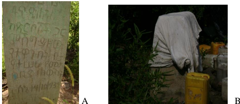
Fig.12. The monuments at the place where Emperor Yohannes was wounded (A) and at the place where he died(B)

considered this water as a holy water, named it Yemariam Wuha (water of St. Mary) and are still using it to rinse in and drink to be cured from diseases and to avoid bad spirits.