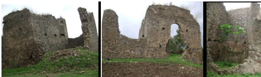
Fig. 3. Kezen castle from different angles (exterior and interior)

Another important architectural heritage with the Gondarine architectural style is the castle of Kezen in Alefa Takusa District. The castle of Kezen is an hour walk from Shawra, administrative capital of Alefa Takusw woreda. It consists of impressive remains of Gondarine architecture. I had come across with this structure while travelling for another research. Local people believe that this castle was used to store cereals during the time of Gondarine kings, but this was not confirmed by the reliable secondary sources. It is not included in the heritage list of the local and zonal culture and tourism offices due to this constraint. The architectural structures of Kezen Castle, and particularly the arks of the doors and windows would help researchers to compare and contrast with the other architectural styles of Gondarine and pre Gondarine buildings in the surroundings.