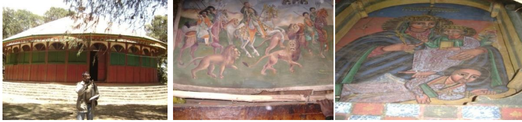
Fig. 10. Derasgie Mariam Church and its wall paintings