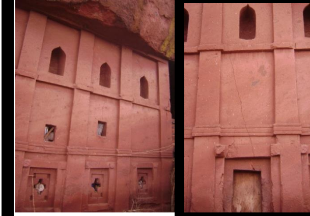
Fig 4. The rock hewn church of Zoz Amba Giyorgis with unfinished roofing (A) and cracked wall (B)

The rock hewn church of Zoz Amba is very important as a reference to compare the methods of construction of the rock-hewn churches. While many of the rock-hewn churches are believed to have been carved from top to down, the unfinished roofing of Zoz Amba shows its construction from bottom up. This structure also helps geologists analyse the rock type in comparison with that of Lalibela. Regarding the current status of this rock-hewn church, it suffers from physical erosion and degradations and most of its parts are in a critical condition. As the above picture (B) shows, part of the wall has cracked. There is great need of taking immediate measures to preserve the building from further deterioration.