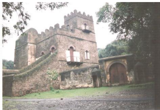
Fig. 2. Castle of Ras Ginb

Ras Ginb is believed to have existed and had become a visible symbol of the power of the Ras Behtwadam by 1767. The building came to symbolize both the appointment of and governance by the Ras Behtwadam and the praise that Mikael and his successors and predecessors sought to posses at all costs ( Ibid. .421). It is to be recalled that a tradition known as ‘Gondar style architecture’ which was employed exclusively for royally commissioned buildings and which was a semi-military style characterized by construction in brown basalt and lime mortar round corner towers with domes.. The references assign each of the castles of Gondar to a particular ruler, beginning with Sertse Dengle. Ras Ginb is fashioned in the same distinctive architectural style as other stone castles and churches of Gondar.