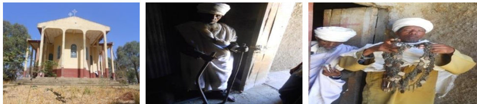
Fig. 9. Chenker T/Haymanot church and its historic objects endowed by Tewodros